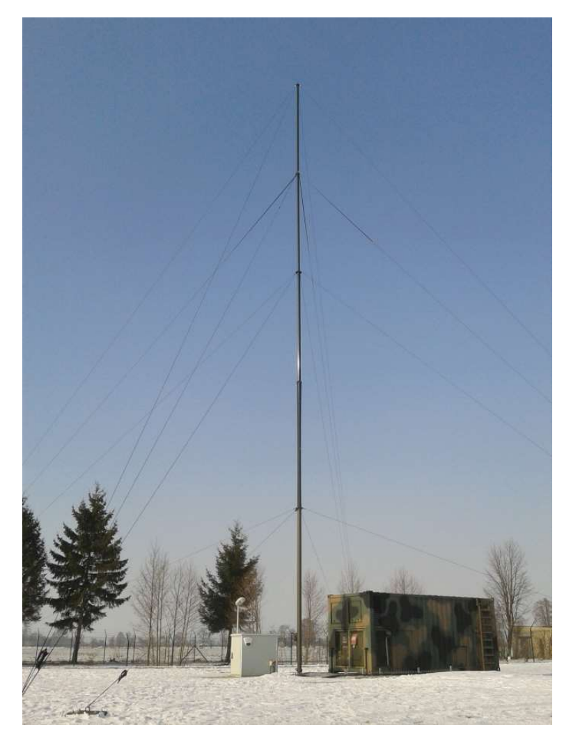
Fig. 2. Typical Polish LINK 16 radio site<sup>6</sup>

Further implementation steps within Polish Air Force meant setting up CSI's (Control and Reporting Center System Interface) located in AOC-ACC, 22<sup>nd</sup> CRC, 1<sup>st</sup> RCRC and DCRC each of which is an interface – gate between command system and platforms/systems based on tactical data links.